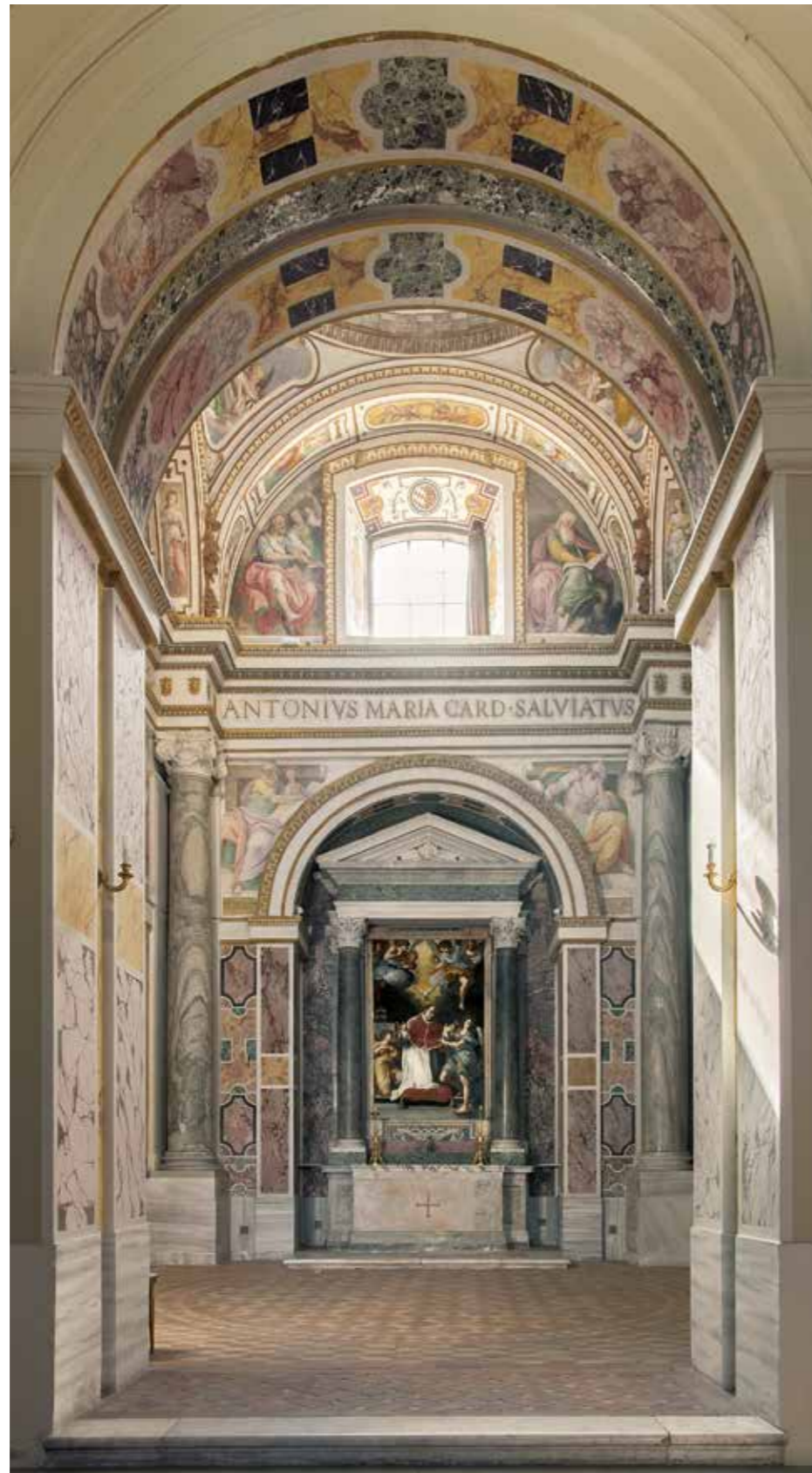
FIG. 1. Salviati Chapel, Santi Andrea e Gregorio al Monte Celio, Rome.