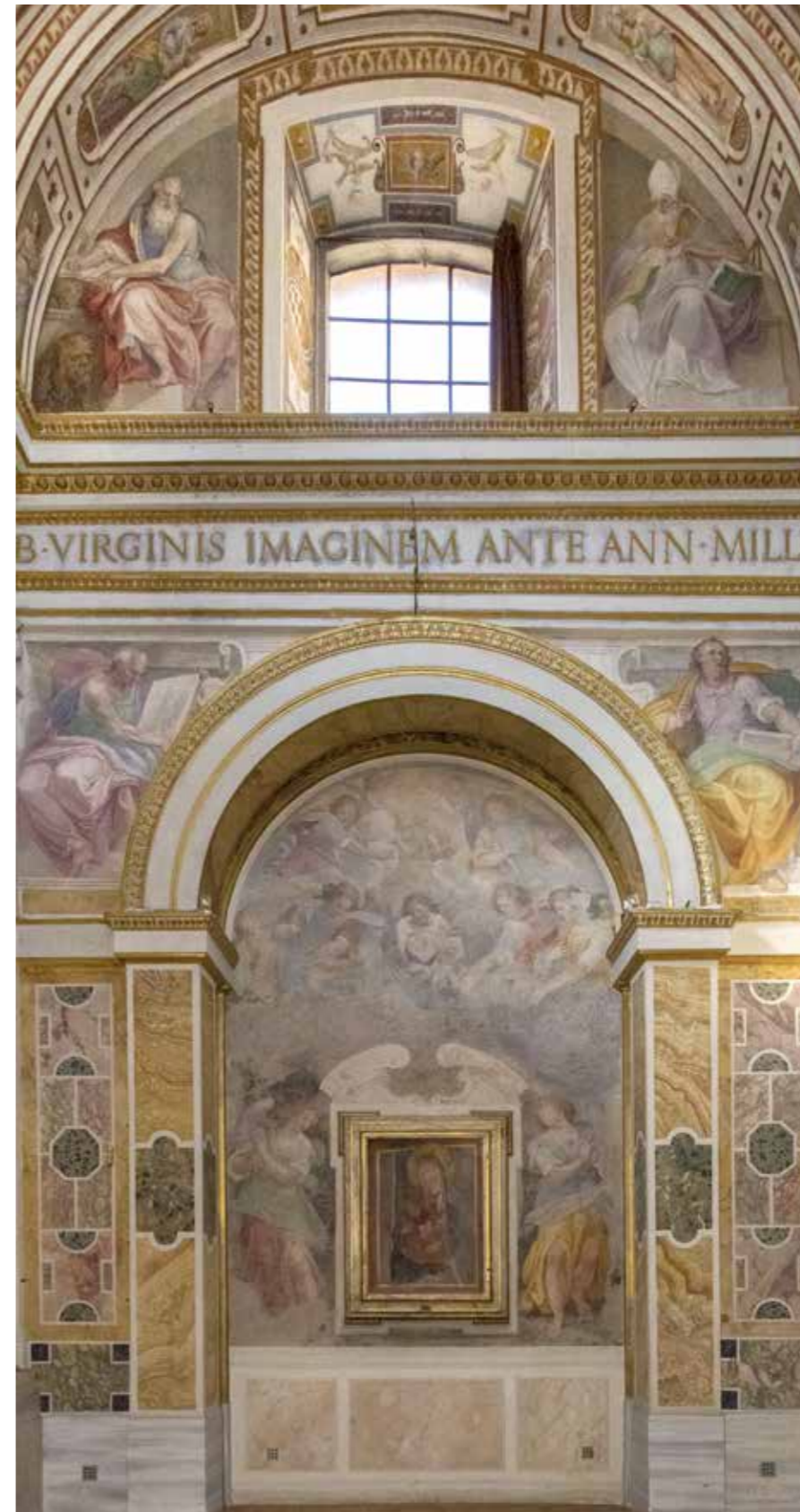
FIG. 3. Salviati Chapel (right wall), Santi Andrea e Gregorio al Monte Celio, Rome.