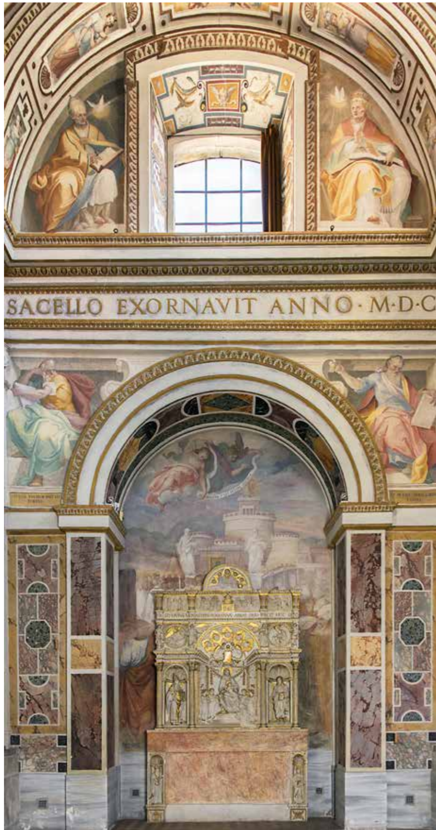
FIG. 2. Salviati Chapel (left wall), Santi Andrea e Gregorio al Monte Celio, Rome.